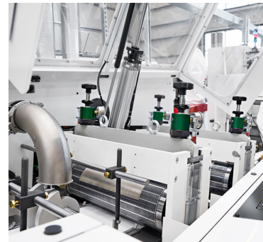
Double die cutter