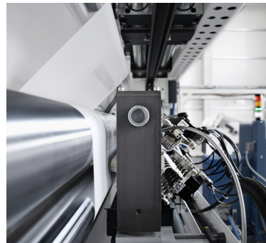
Filling edge sealing