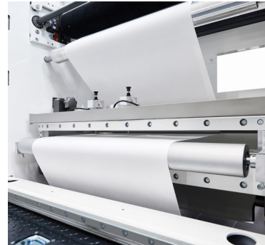
Wicket hole punching unit